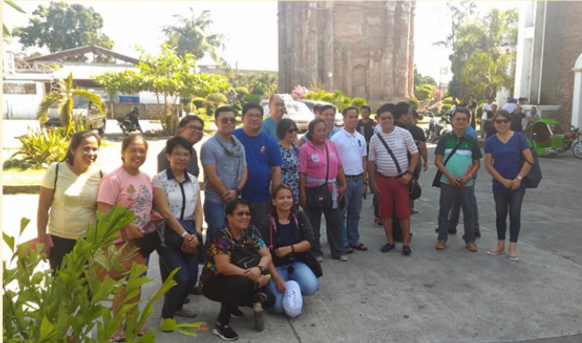
The participants in front of the San Andres Apostol Parish Church in Bacarra, Ilocos Norte.