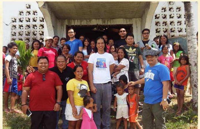
The friars visited one of the chapels under the Santa Ana Parish in Burgos, Surigao del Norte.