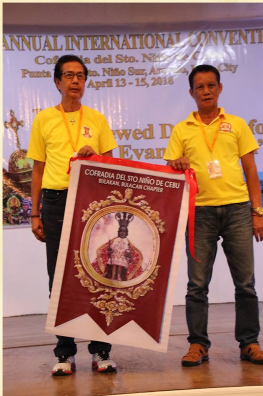
Delegates from the Bulacan Chapter of the cofradia during the parade of banners/standards on the first day of the annual convention.