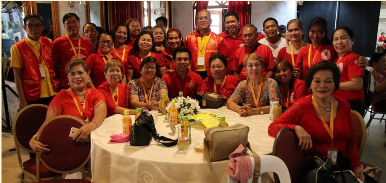
Some of the delegates to the 34th Annual National and 1st International Convention of the Augustinian-directed Cofradia del Santo Niño de Cebu held in Iloilo City from April 13 – 15, 2018.