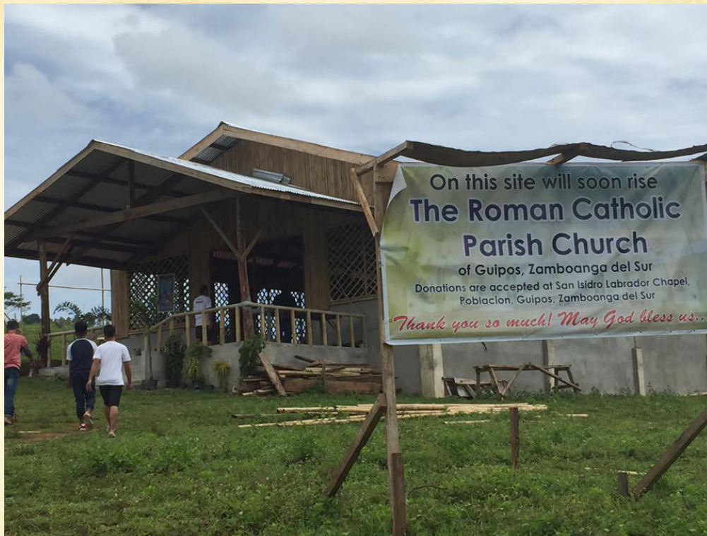
On this site will soon rise The Roman Catholic Parish Church of Guipos, Zamboanga del Sur