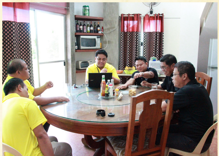
Some chapter delegates deliberating their assigned provincial policy during the working group discussion.