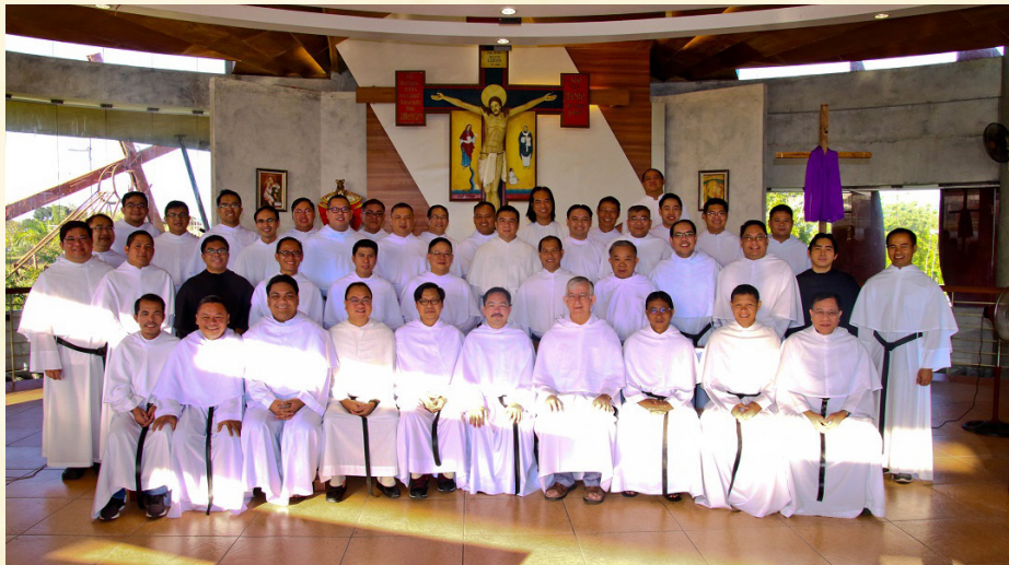
The Chapter Delegates posed for posterity after the morning Mass on the 4th day of the Intermediate Provincial Chapter.