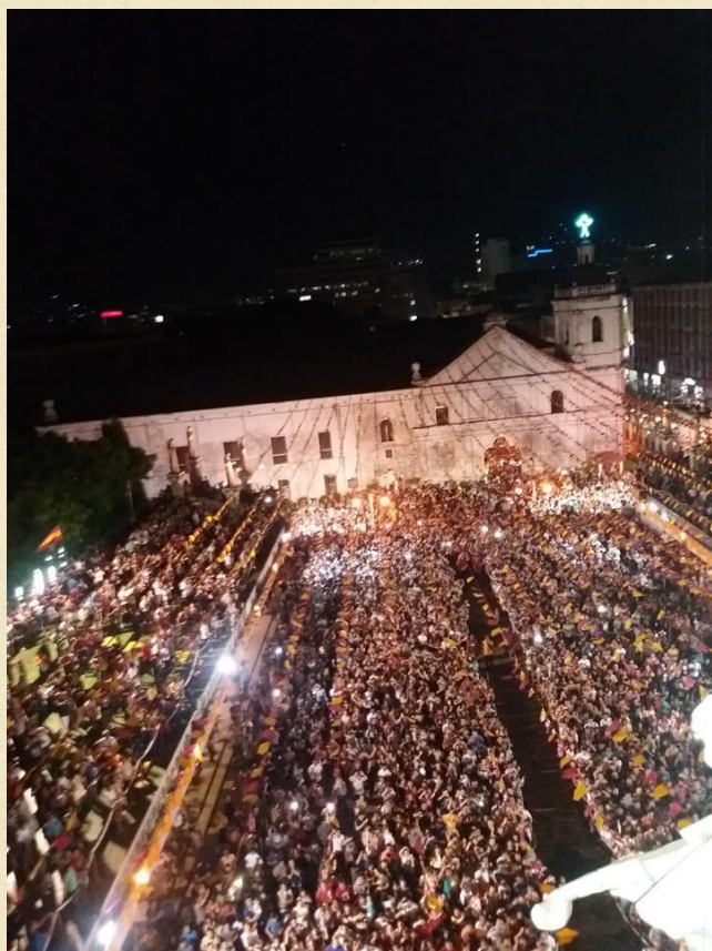
TRADITIONAL RELIGIOUS SINULOG in celebration of the 454th Anniversary of the Finding of the Miraculous Image of Señor Santo Niño de Cebu (April 28, 2019).