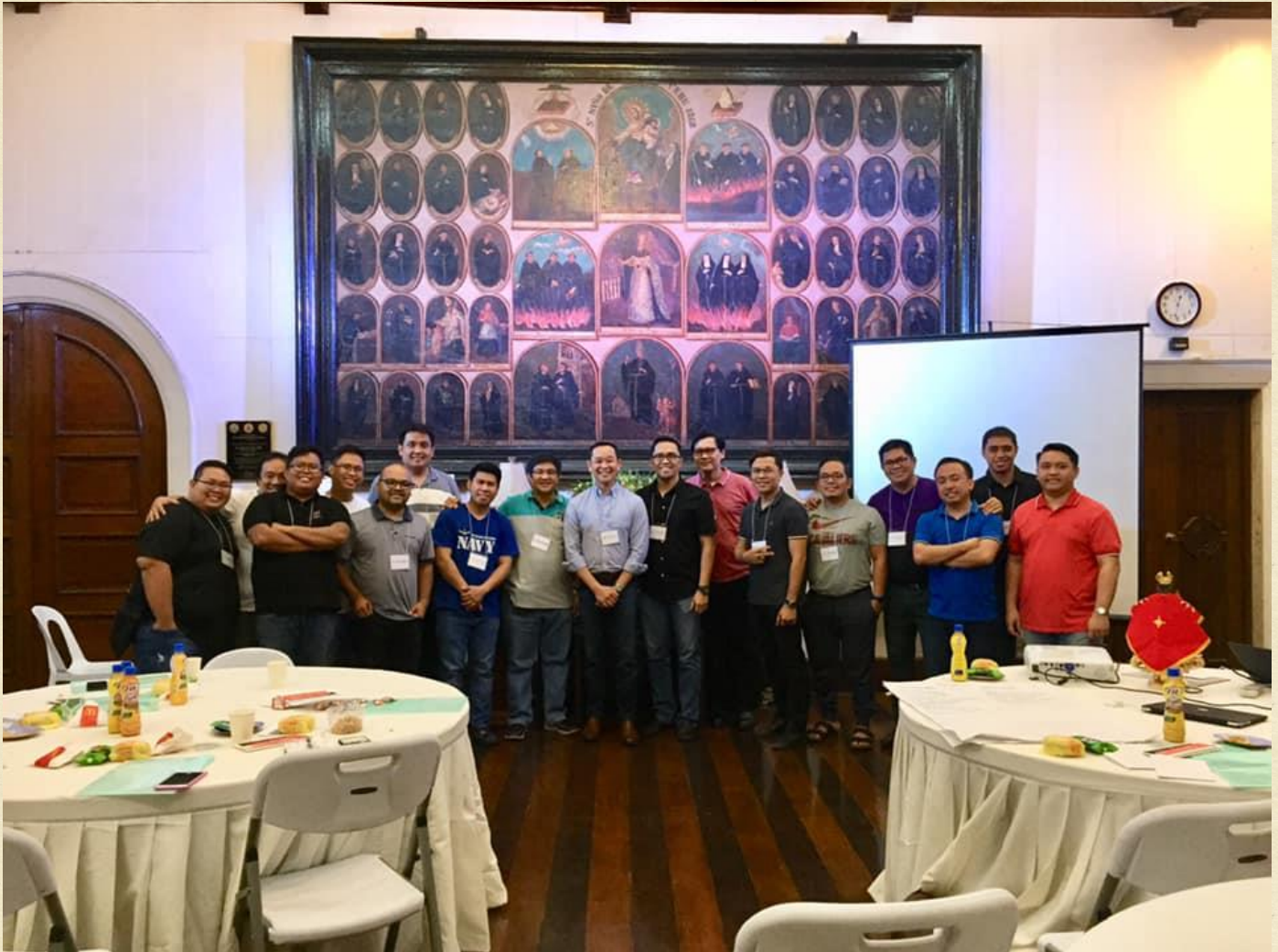
ANNUAL GATHERING OF LOCAL DIRECTORS OF VOCATIONS (LDVs). July 5 to 7, 2019 at the Basilica del Santo Niño, Cebu City and at White Sands Beach Resort, Mactan, Lapu-lapu City.