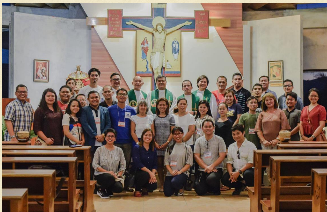
Participants of the Seminar Workshop on Creating Resilience on People and Cultural Properties towards National Well-Being (June 18 – 21, 2019 at SNSC).